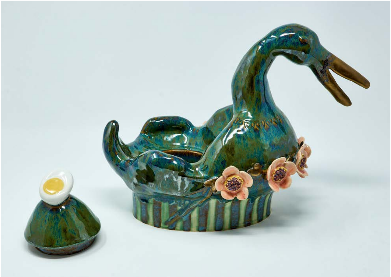
Holly Stevenson A Duck for Georgia (2022) glazed stoneware, 24 x 31 x 16 cm £3,000