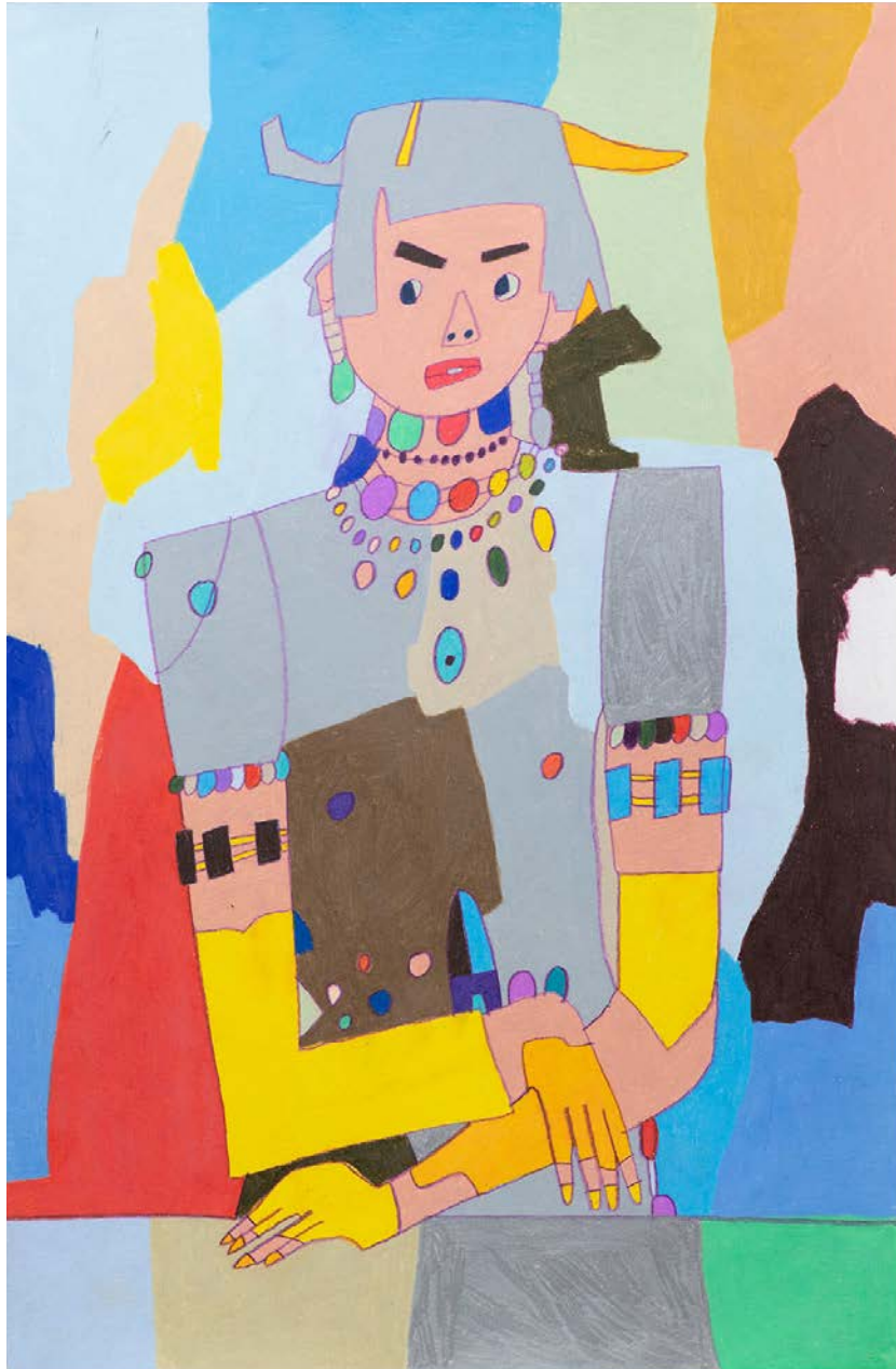
Anthony Romagnano Untitled (2021)

Prismacolor on paper, 55.5 x 36.5 cm £520