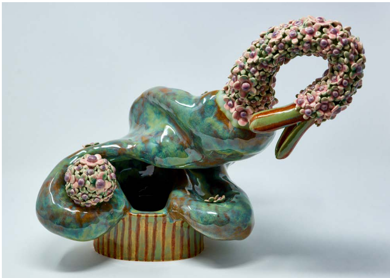
Holly Stevenson A Softening (2022) glazed stoneware, 28 x 30 x 35 cm £3,400