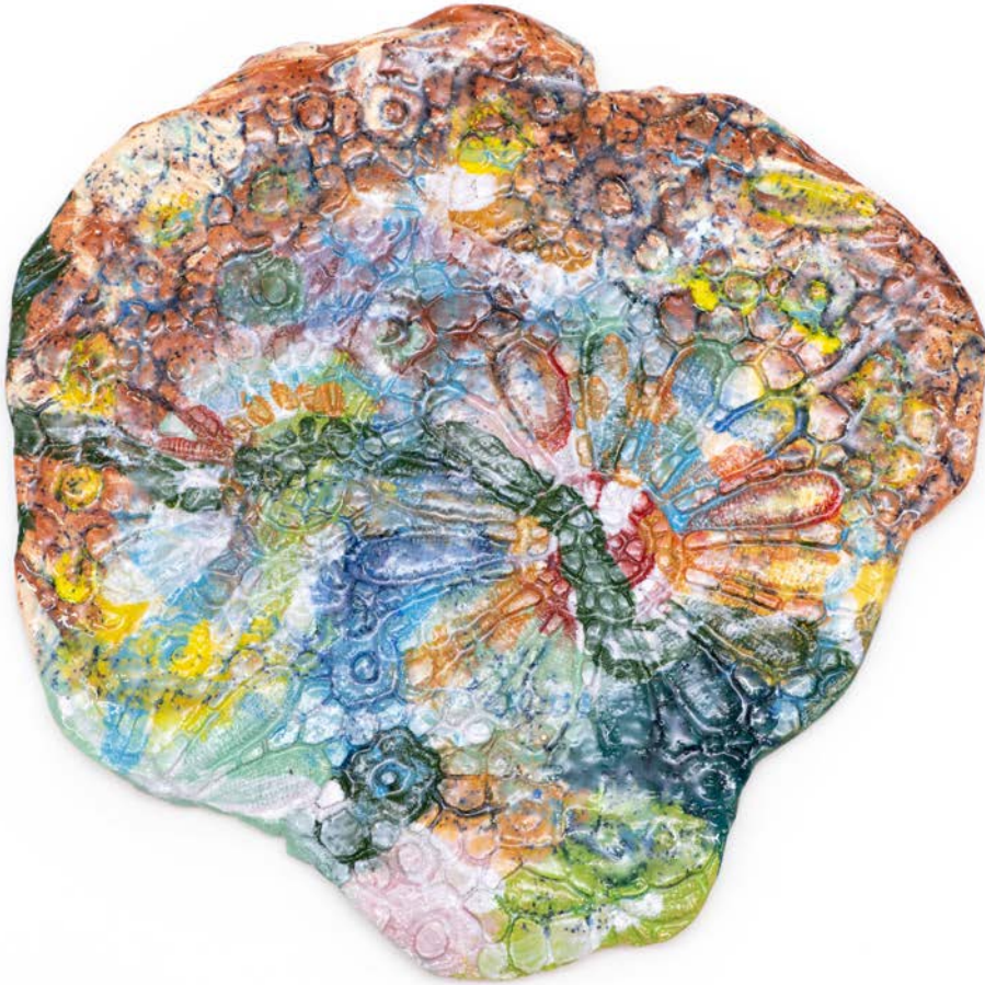
Georgia Szmerling Untitled (2022) glazed earthenware, 1 x 27 x 27.5 cm £320