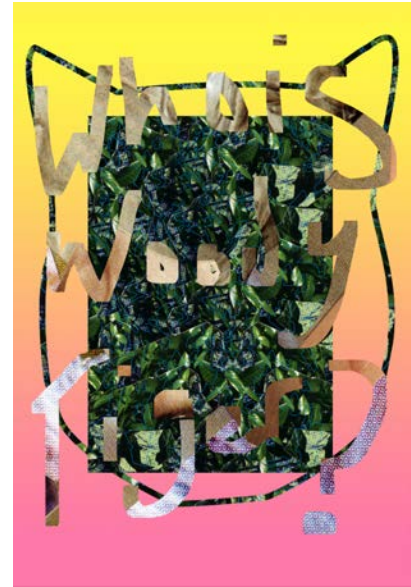
Cherelle Sappleton Untitled, Who Is Woody Tiger? (01), Who Is Woody Tiger 02 (2021) digital prints, 42 x 29.7 cm each £75 each, edition of 150