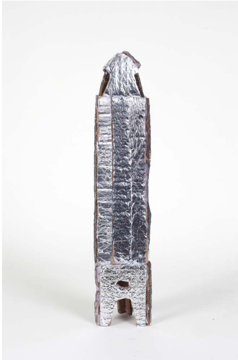
David James Tower in the Sky (2021) mixed-media, 48 x 9 x 9 cm £300