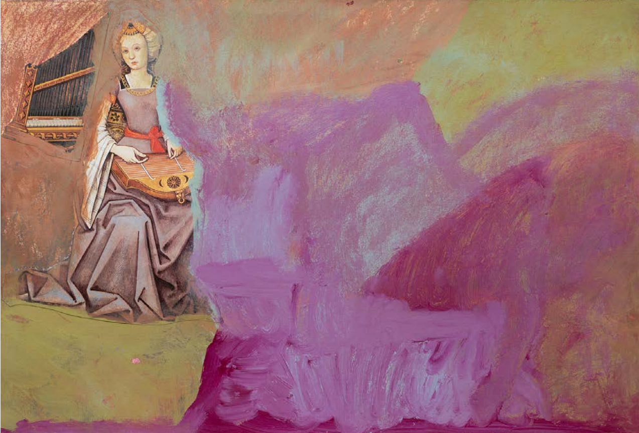
Emily Dober Untitled (2017) collage, acrylic, oil pastel on paper, 38 x 56 cm £350