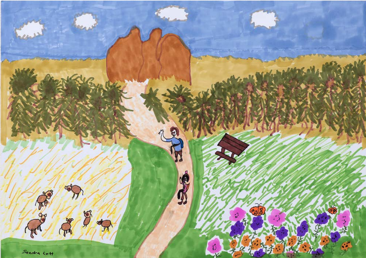
Sandra Lott Dolomites Hiking (2021) felt pen on paper, 30 x 42 cm £250