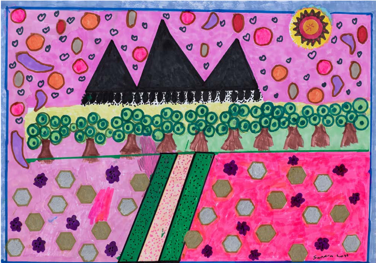
Sandra Lott Dolomites Abstract (2021) felt pen on paper, 30 x 42 cm £250