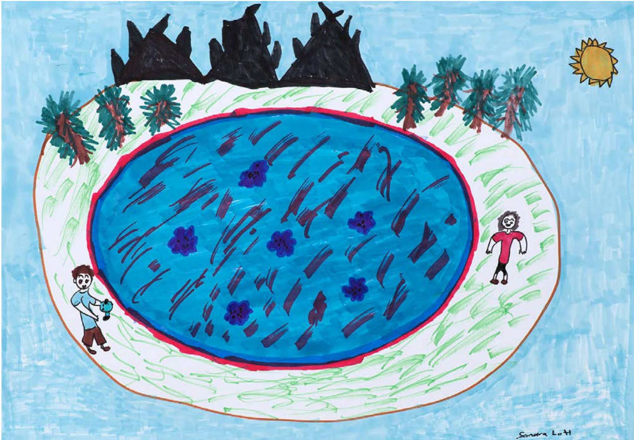
Sandra Lott Dolomites Lakes (2021) felt pen on paper, 30 x 42 cm £250