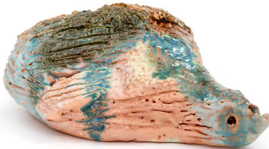
Georgia Szmerling Untitled (2022) glazed earthenware, 8 x 20 x 12 cm £240