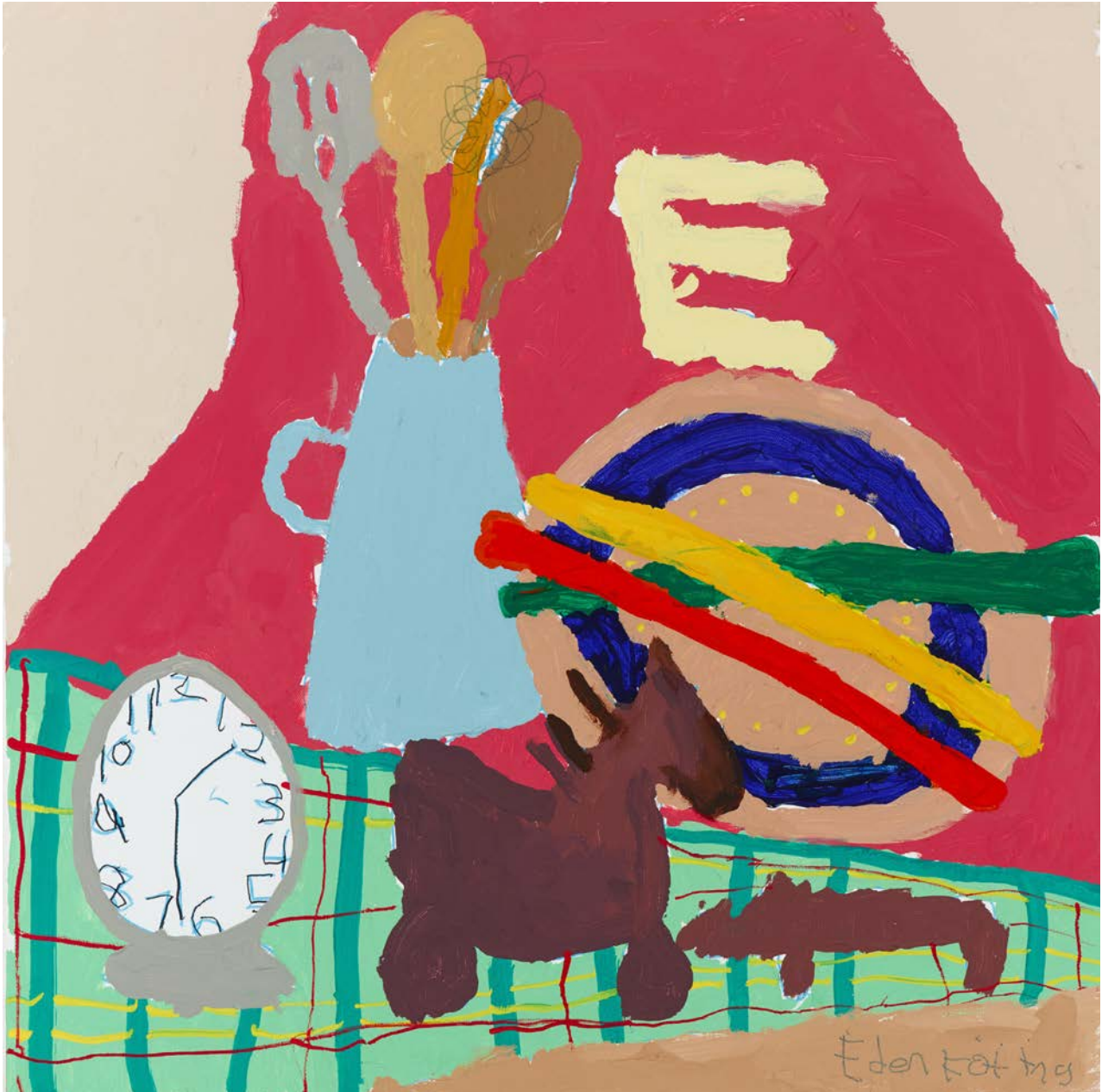
Eden Kötting Still Life with Trojan Horse (2015) acrylic on canvas, 61 x 61 cm £650