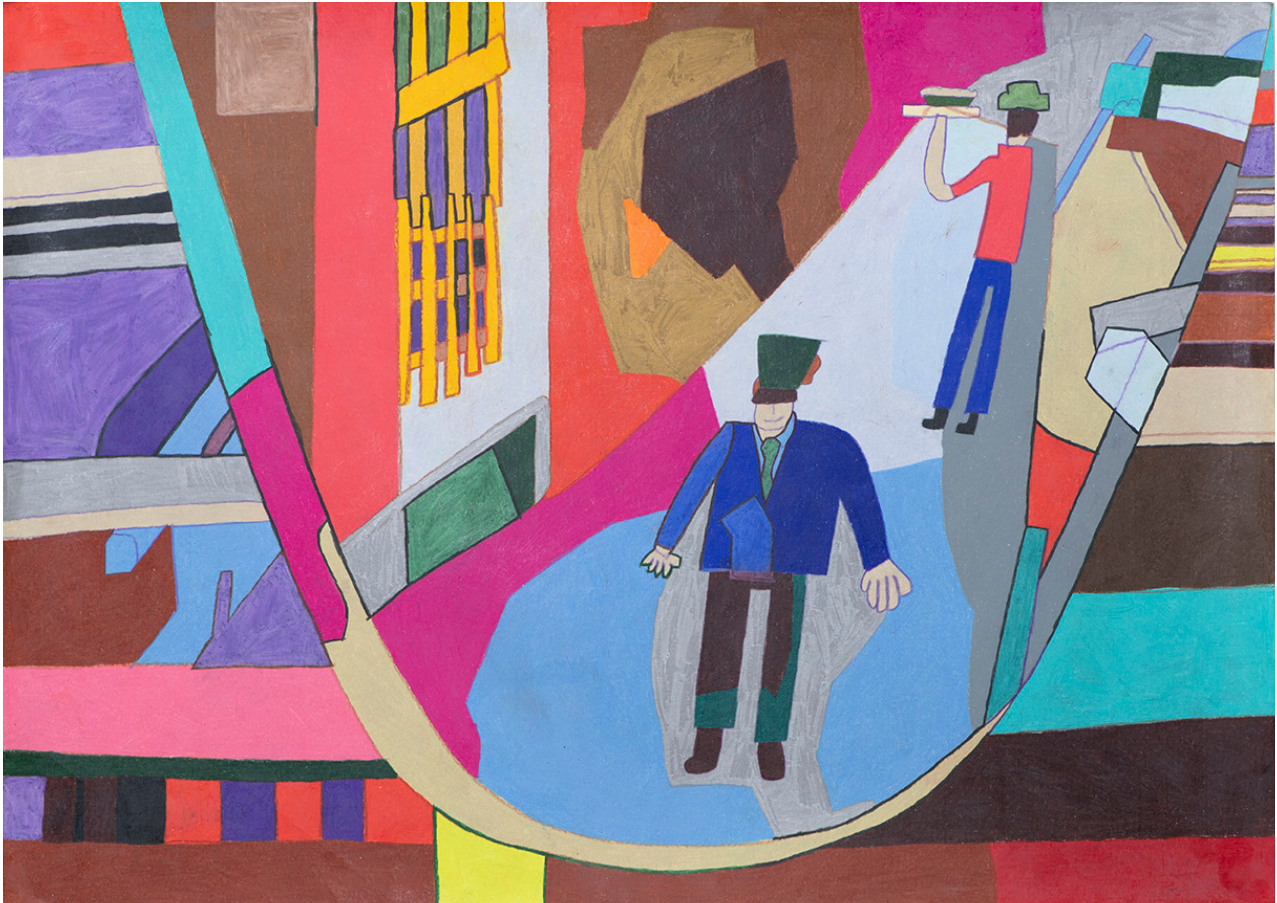
Anthony Romagnano Restaurant's delivery boy and a postman (2021) Prismacolor on paper, 50 x 70 cm £690