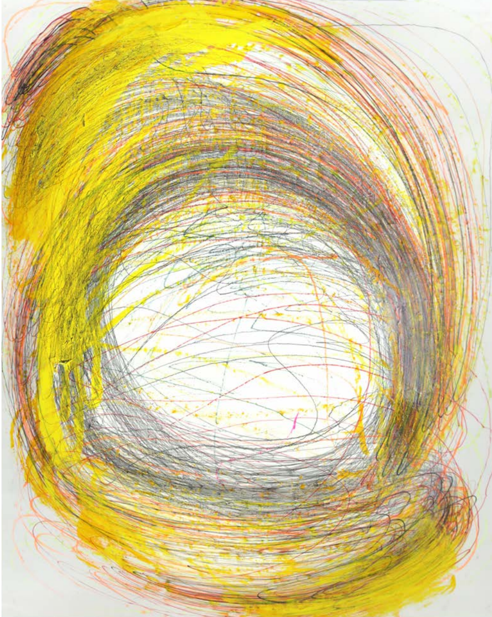
Nnena Kalu Untitled (vortex drawing) (2018/19) mixed media on paper, 126 x 101 cm £2,500