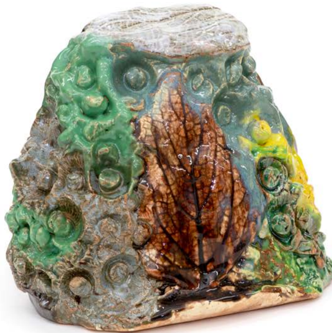
Georgia Szmerling Untitled (2022) glazed earthenware, 25 x 16 x 10 cm £240