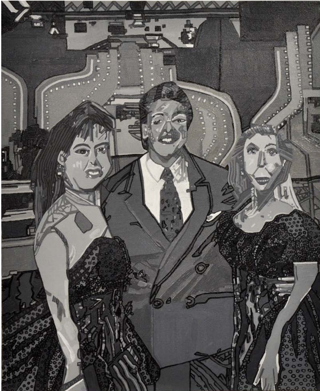
Lisa Reid Turpie (2013) acrylic on canvas, 62 x 51 cm £1,100