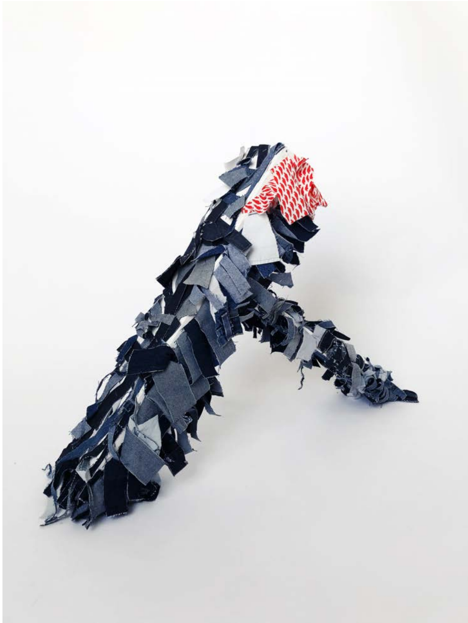
Andrew Omoding Small Door Underneath (2021) wood and fabric, 90 x 84 x 18 cm £2,195