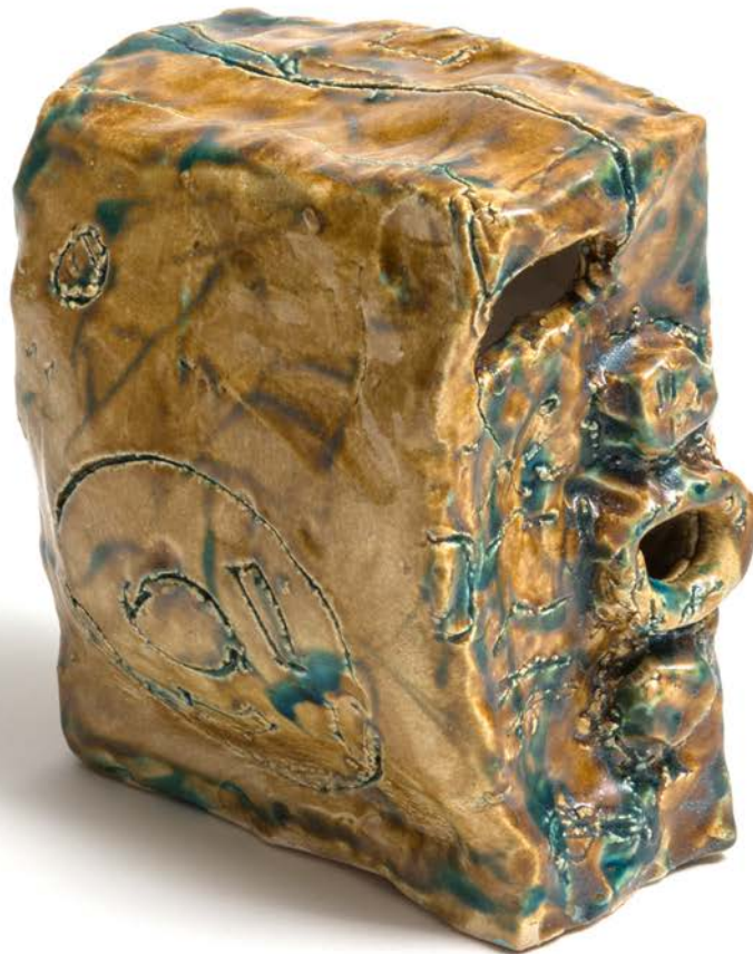
Alan Constable Untitled (2018) glazed earthenware, 19 x 9.5 x 15 cm £1,925