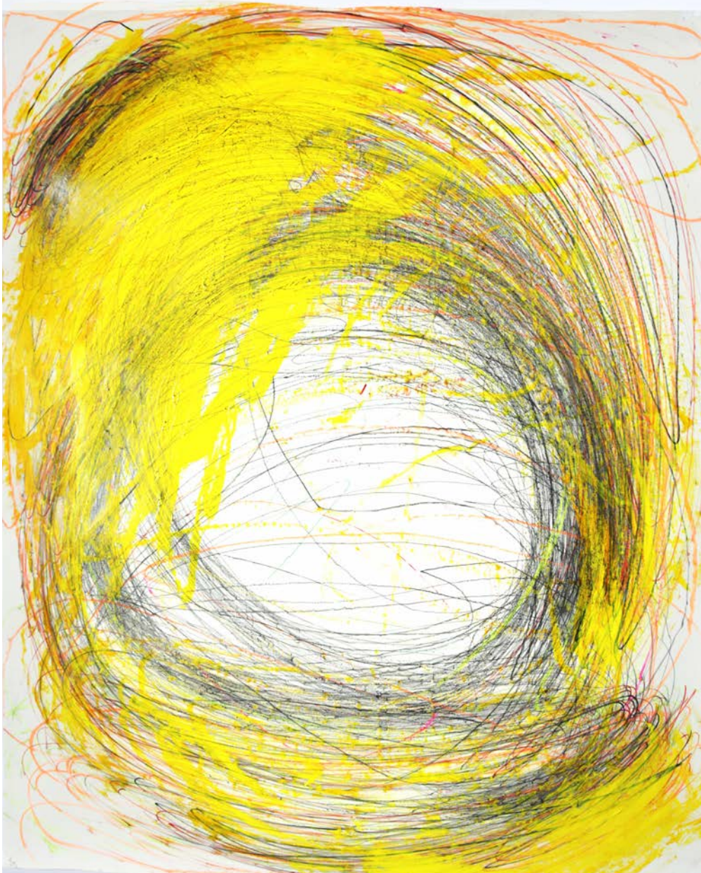
Nnena Kalu Untitled (vortex drawing) (2018/19) mixed media on paper, 126 x 101 cm £2,500