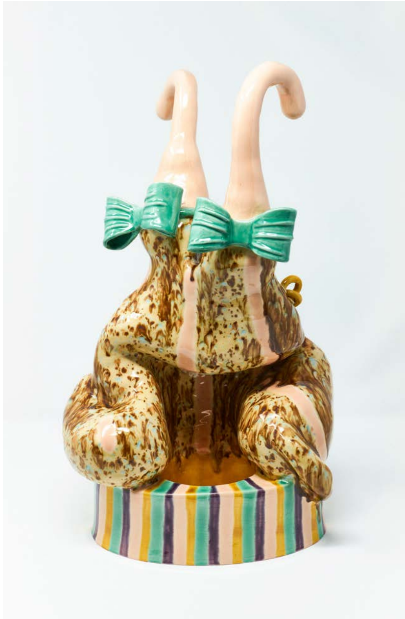
Holly Stevenson Eunuch (2021) glazed stoneware, 44 x 25 x 21 cm £3,000