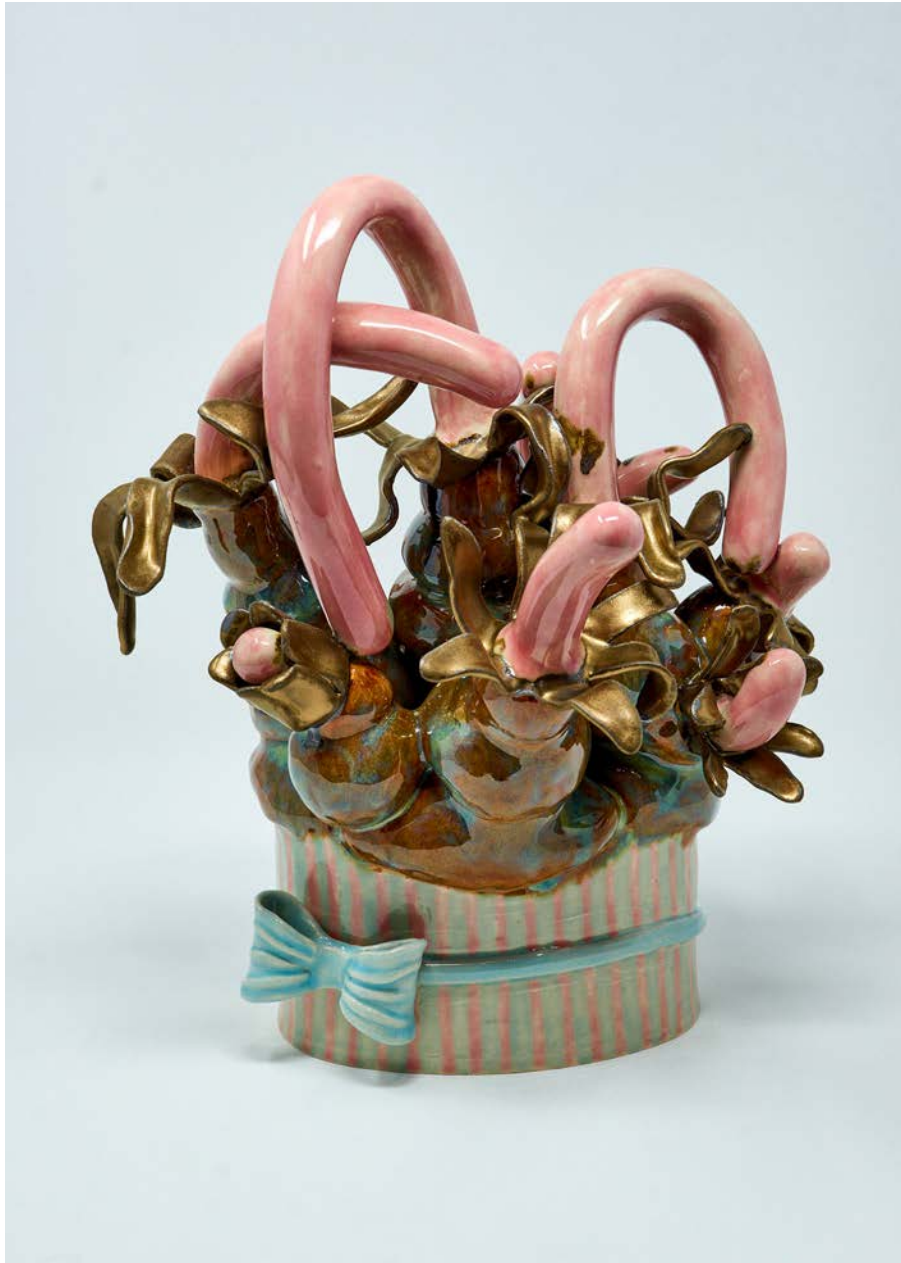
Holly Stevenson With Gratitude (2022) glazed stoneware, 28 x 25 x 23 cm £3,000