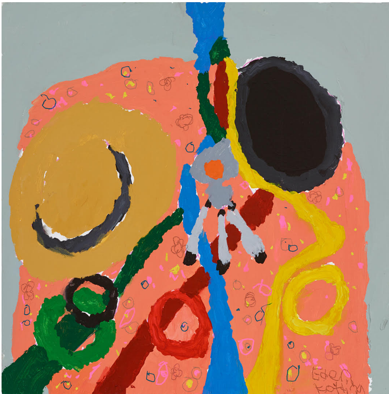
Eden Kötting Random Still Life (2015) acrylic on canvas, 61 x 61 cm £650