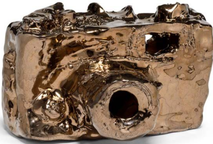
Alan Constable Untitled (2021) glazed earthenware, 10 x 16 x 9 cm £1,925