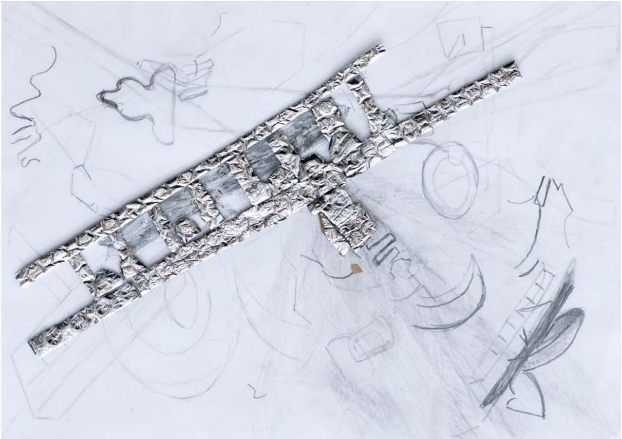
David James City of Angles (2021) pencil and mixed media on paper, 30 x 42 cm £350